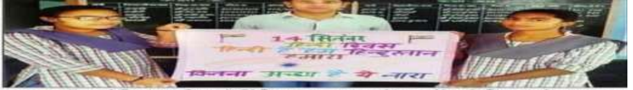
पहलवार में आयोजित कार्यक्रम में हिंदी का सम्मान करने का संदेश देती छात्राएँ।